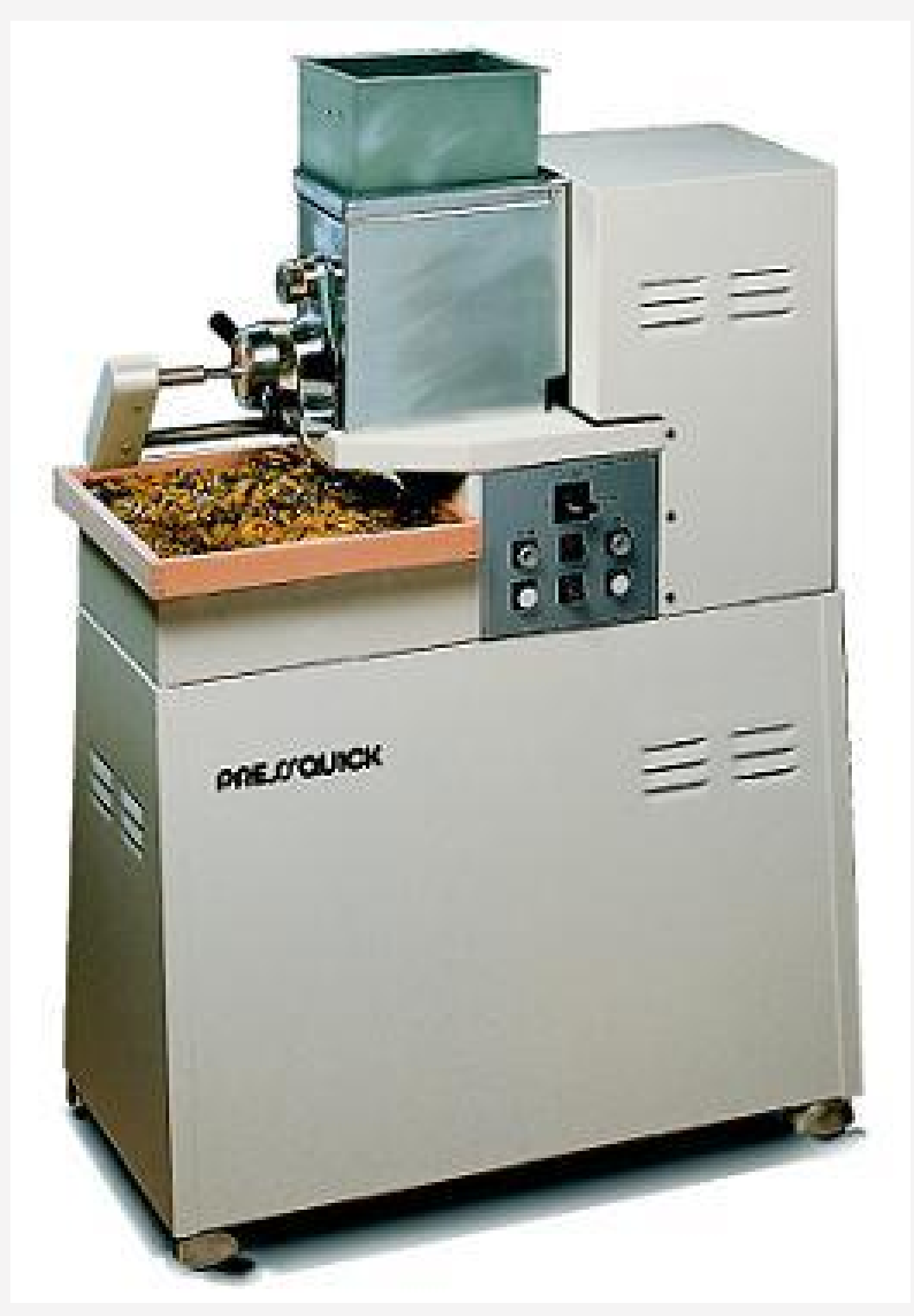
Figure 1: PQ 3-SU