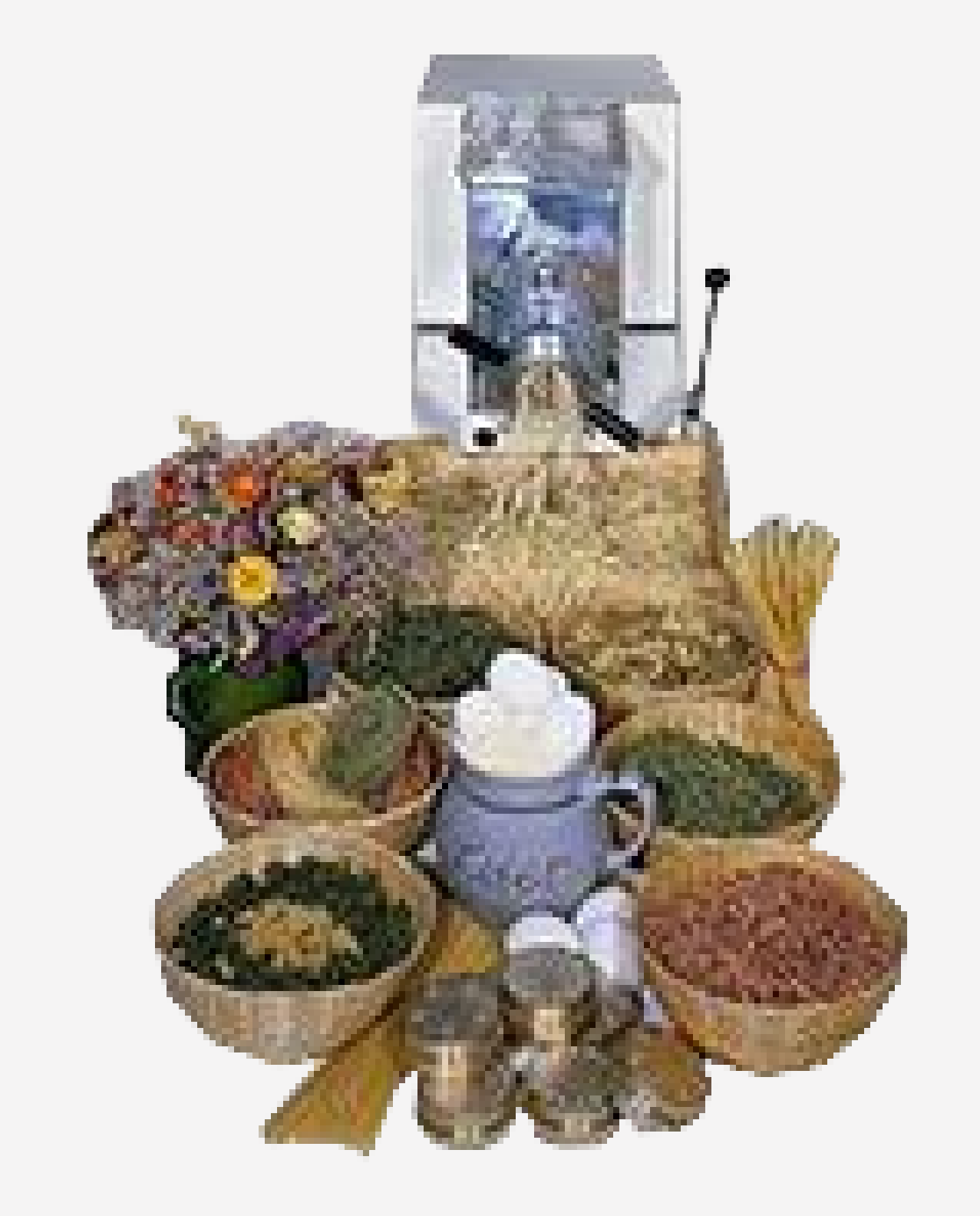
Figure 2: PQ 3-SU and products